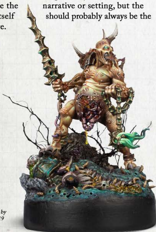
Herald of Nurgle by Yohan Leduc, 2019

A well-made base can be a great way to frame a model and describe the narrative or setting, but the miniature itself should probably always be the main feature.